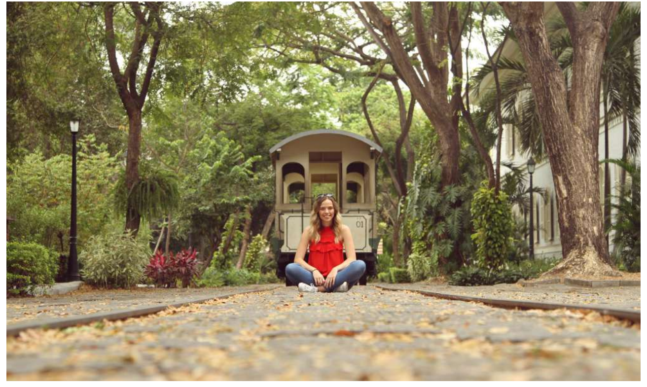
Guayaquil, Guayas.