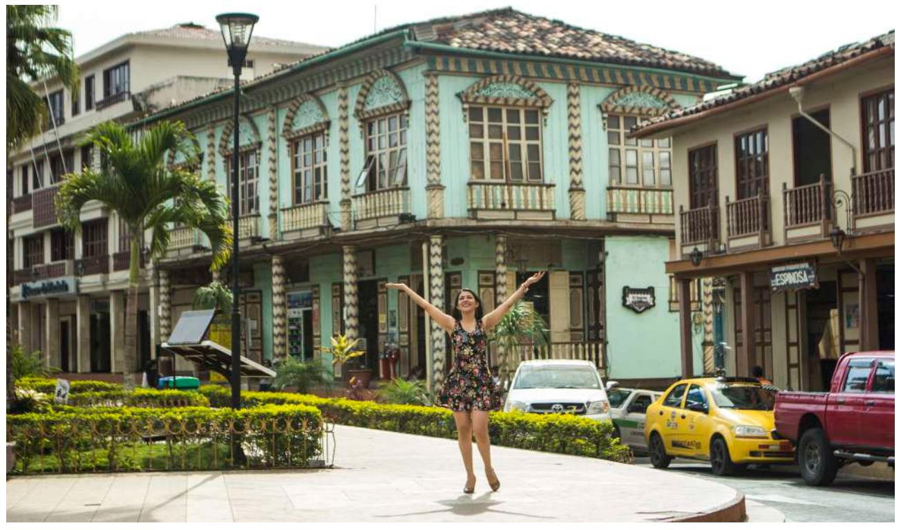
Zaruma, El Oro.