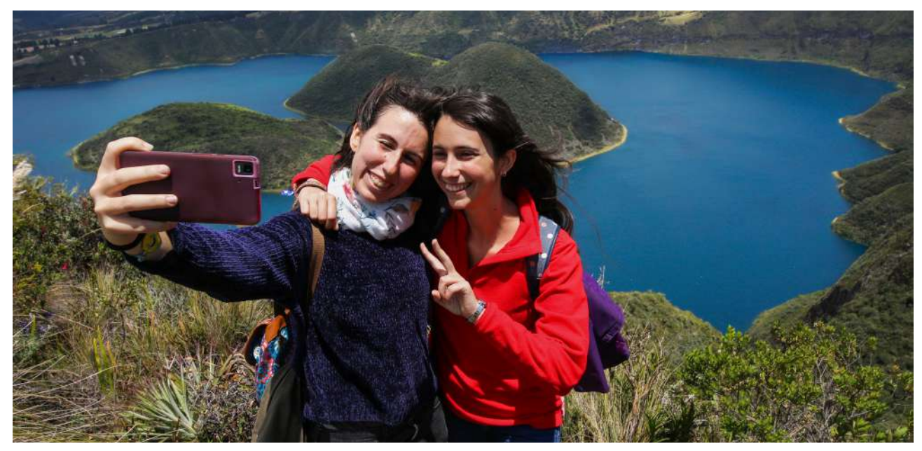
Cuicocha, Imbabura.