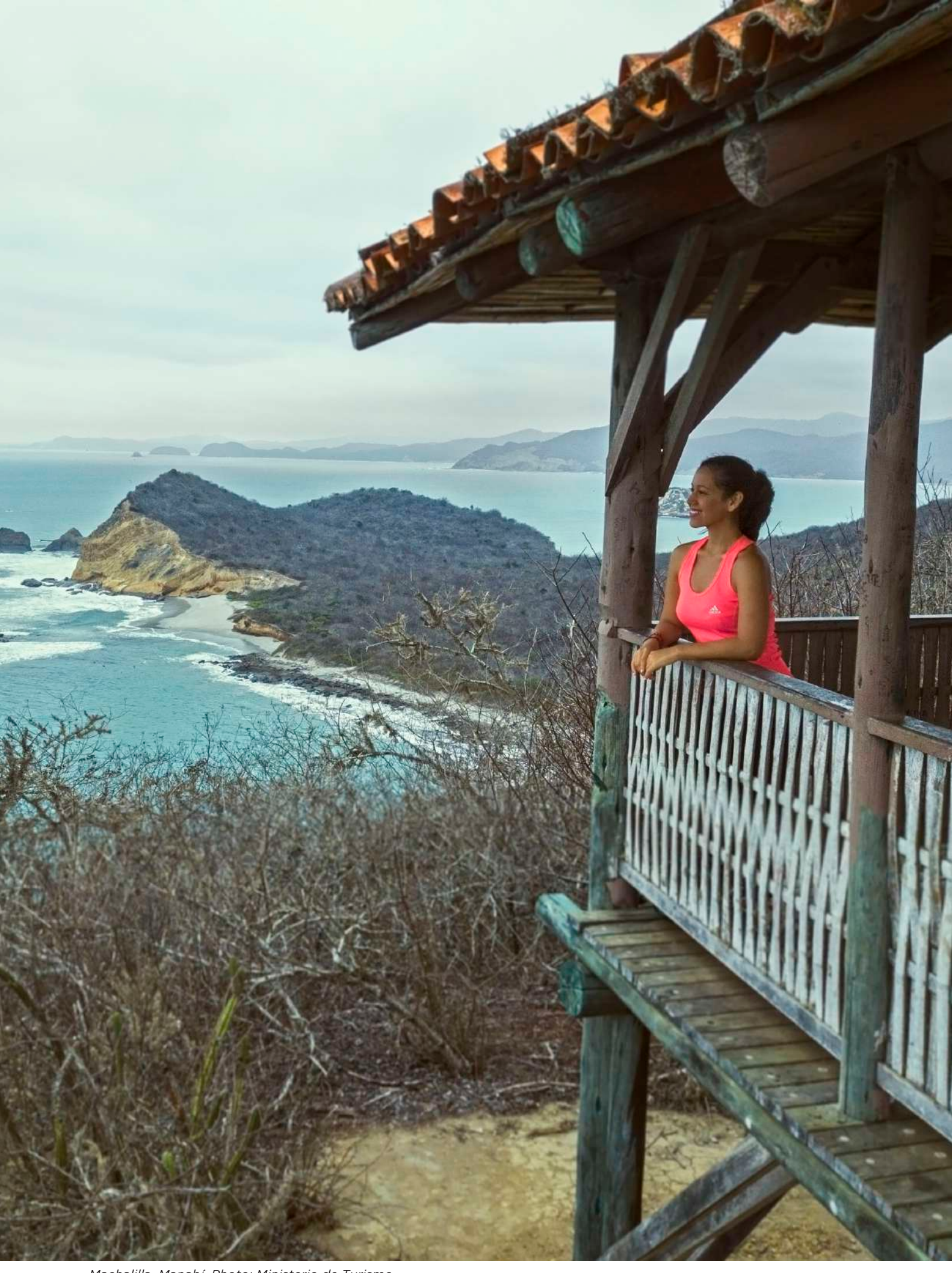
Machalilla, Manabí.