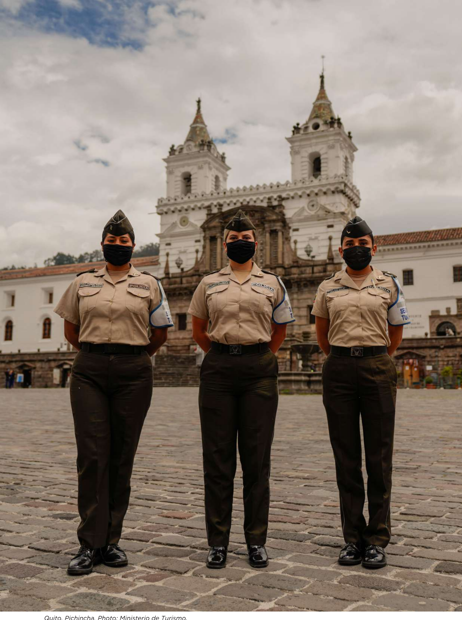
Quito, Pichincha.