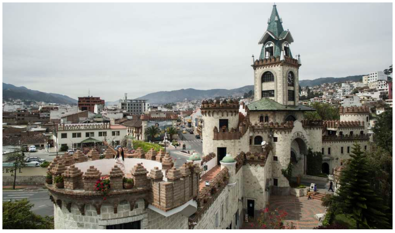
Loja, Loja.