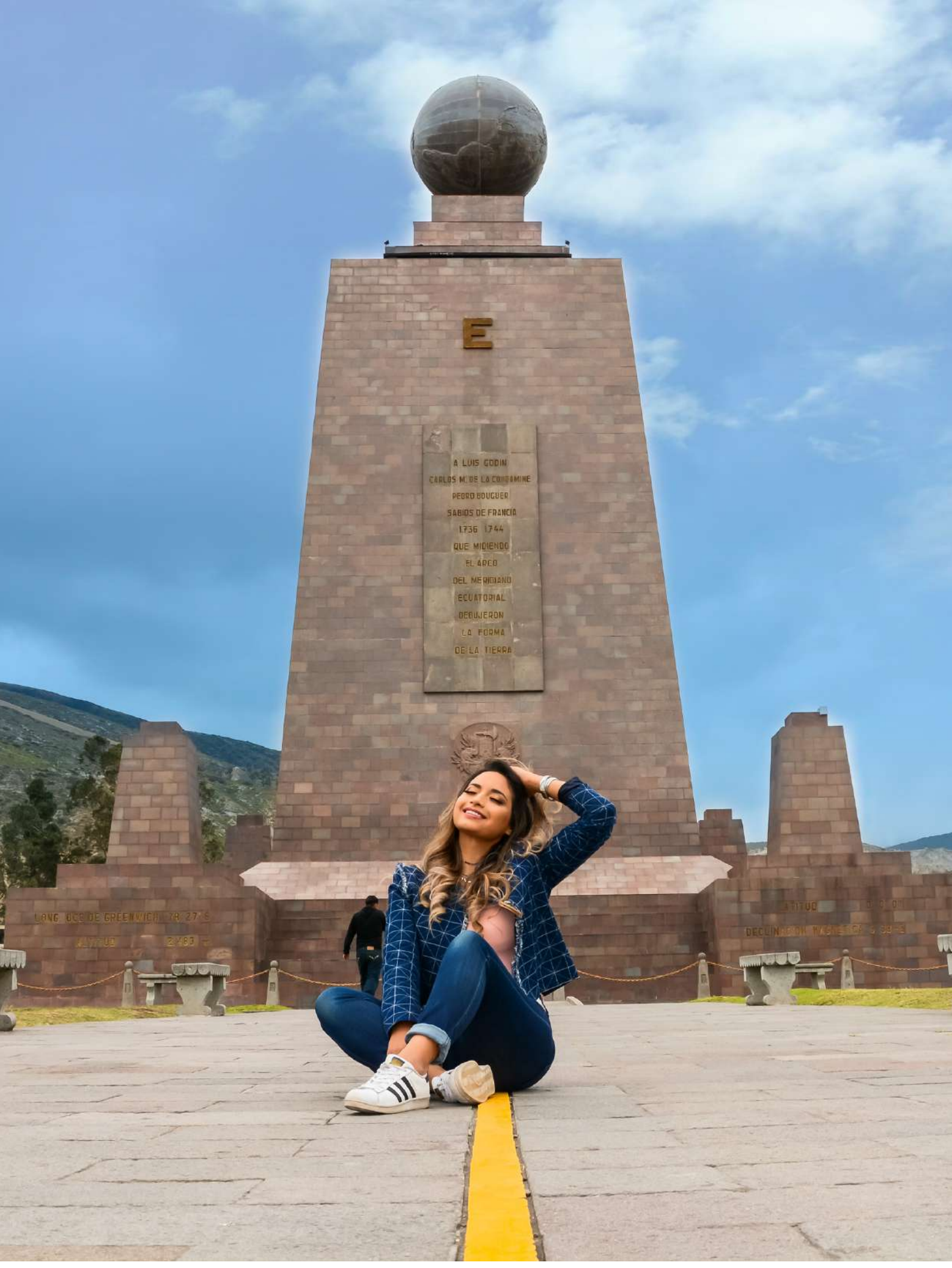
Mitad del Mundo, Pichincha.