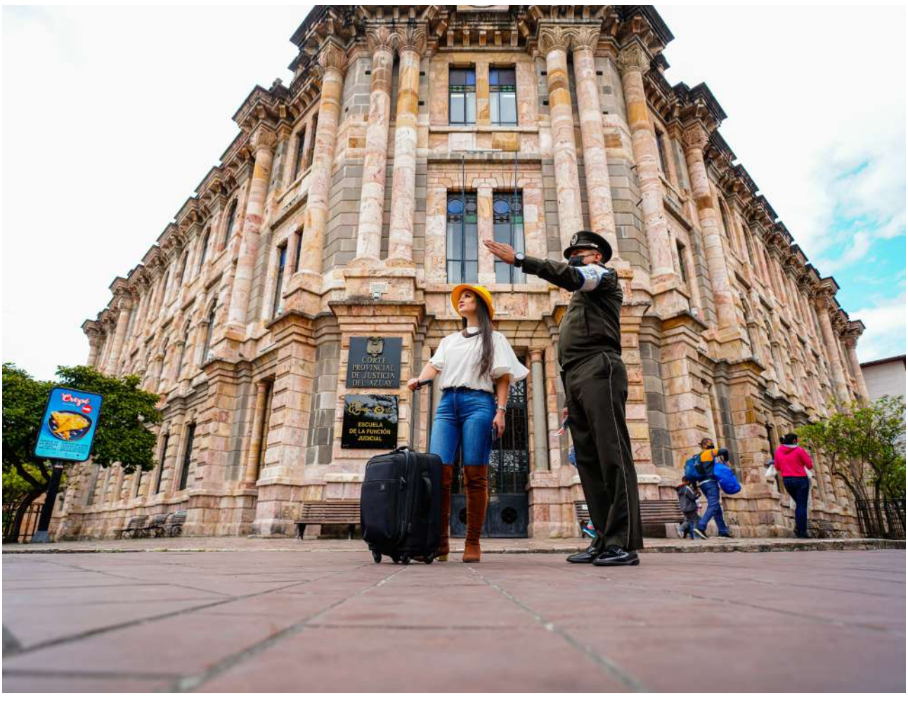
Cuenca, Azuay.