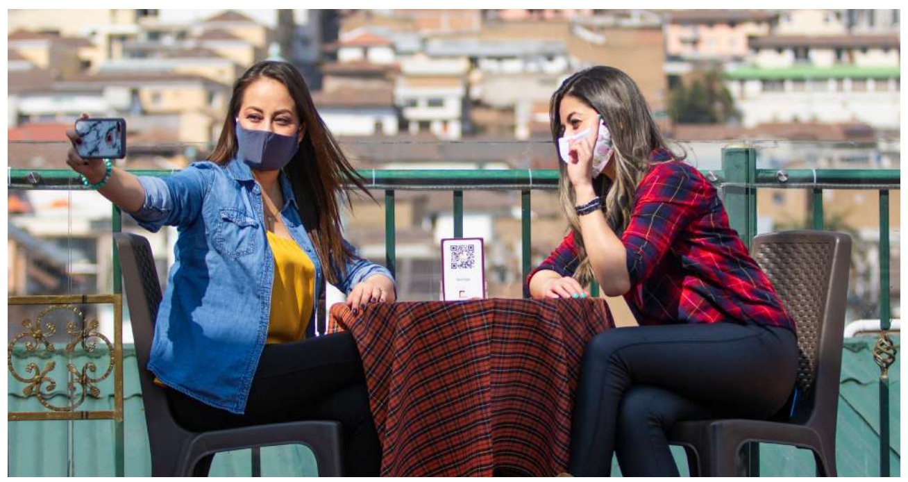
Quito, Pichincha.