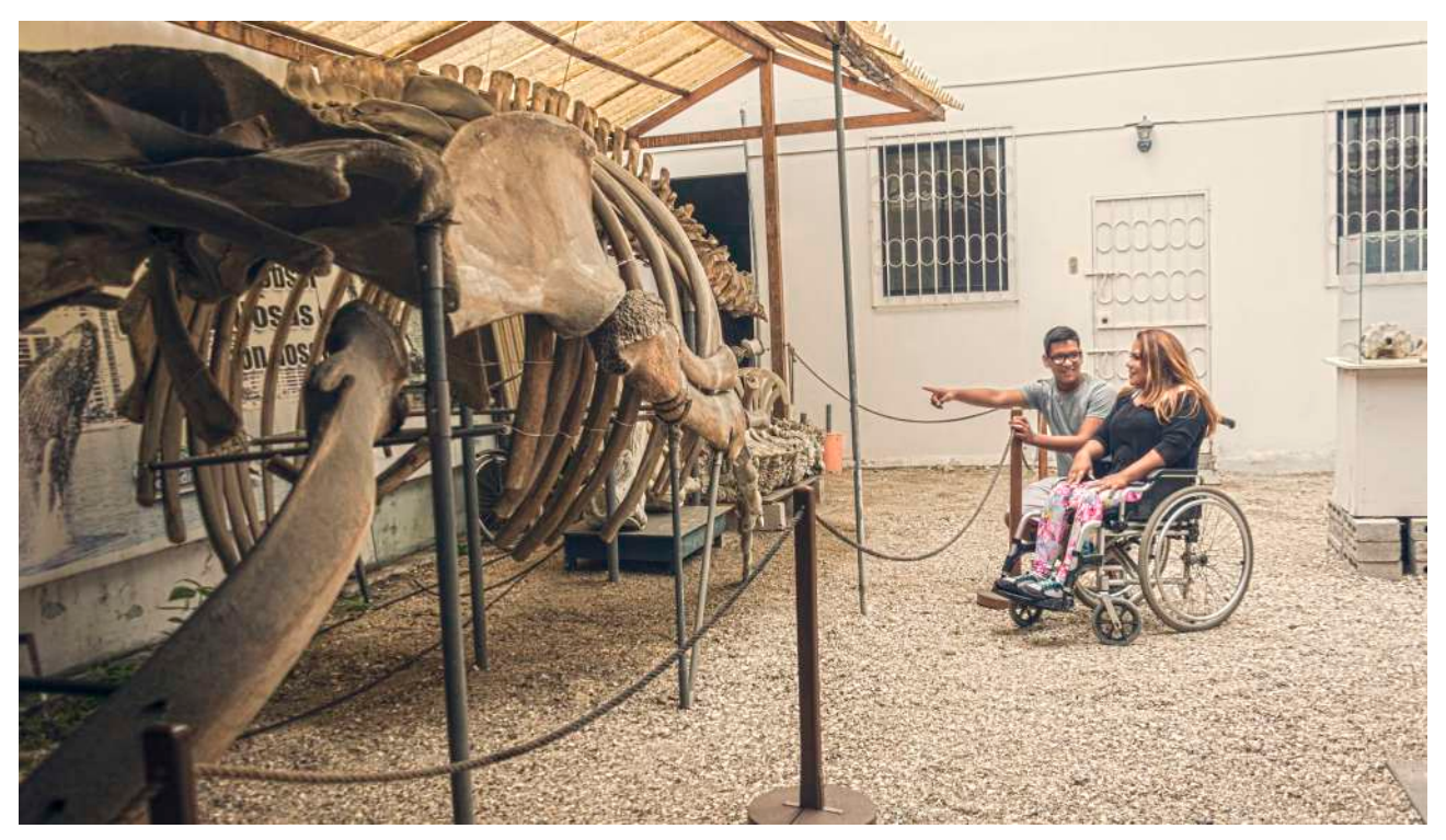
Salinas, Santa Elena.