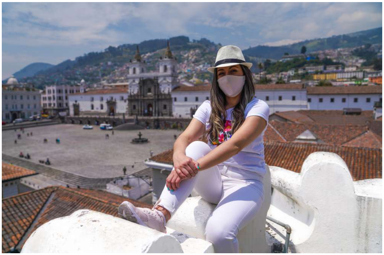
Quito, Pichincha.