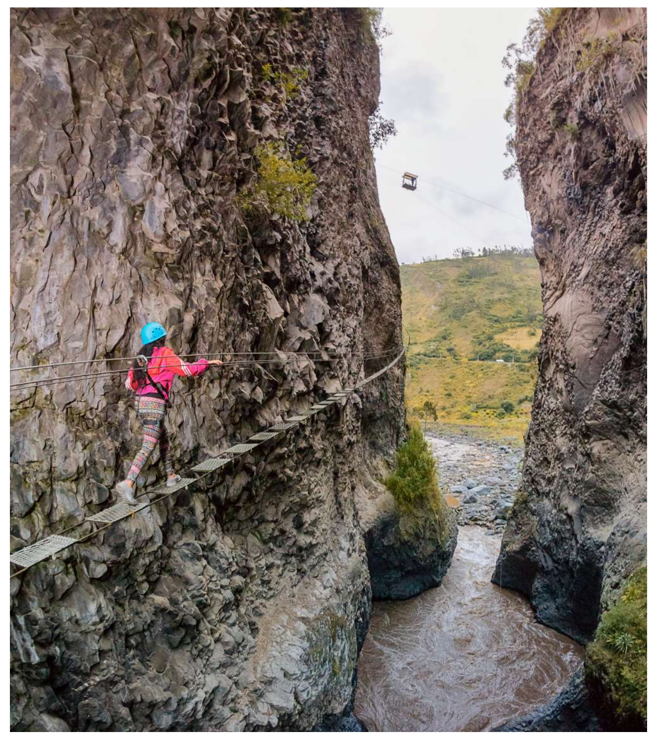
Baños, Tungurahua.