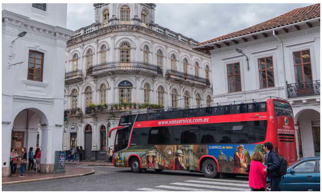
Cuenca, Azuay.