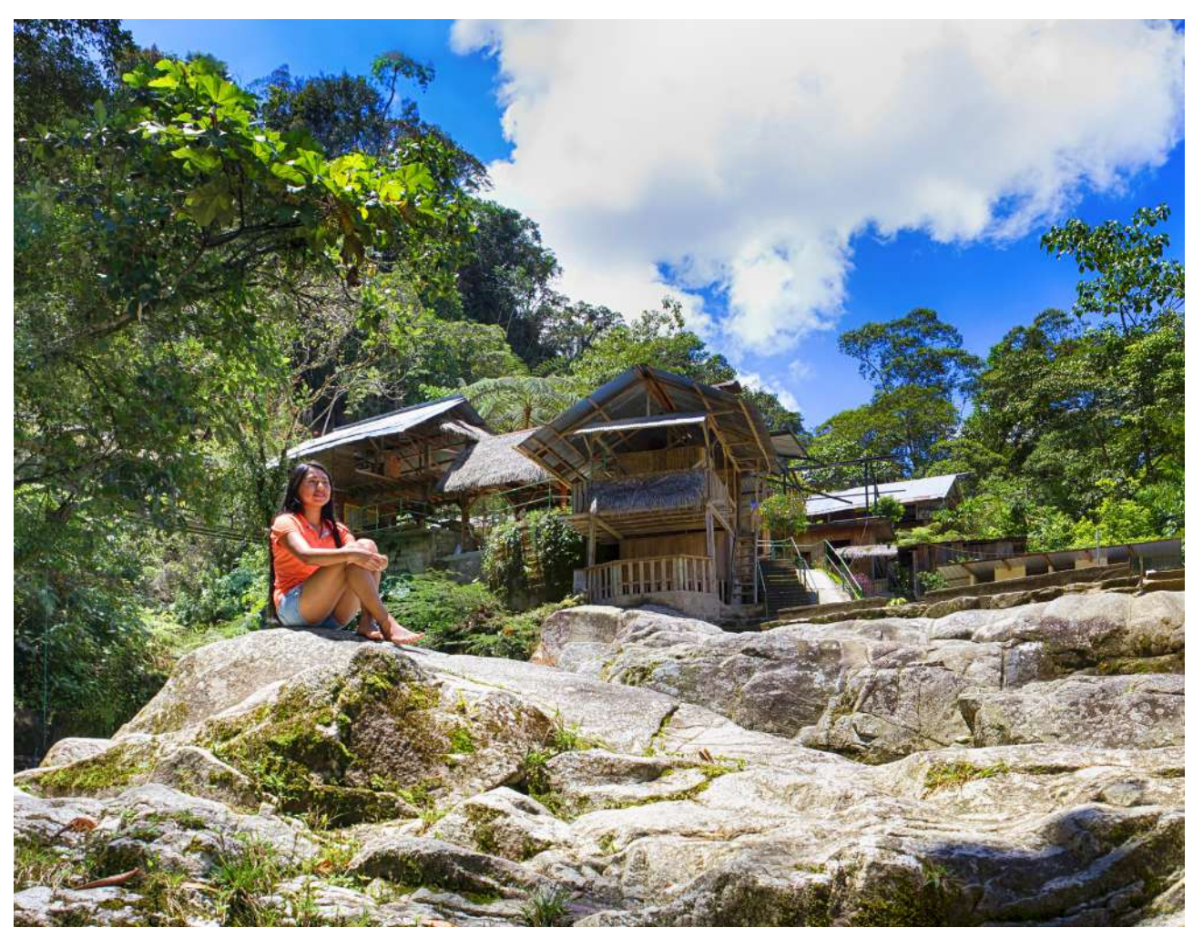
Tena, Napo.