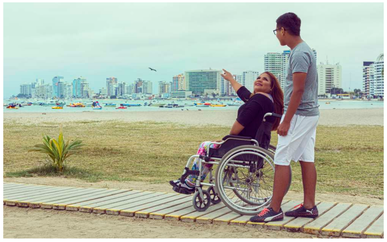
Salinas, Santa Elena.