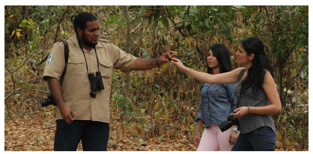
Guayaquil Guayas.