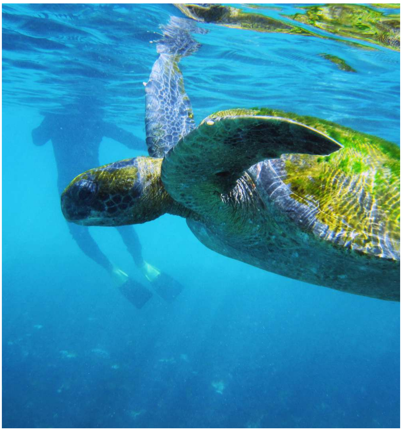
Galapagos Islands.