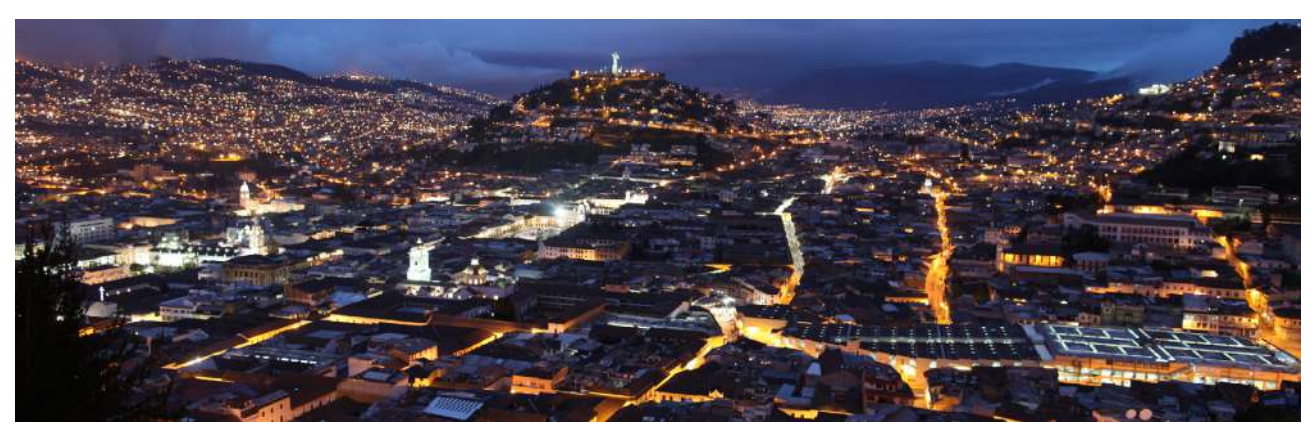
Quito, Pichincha.