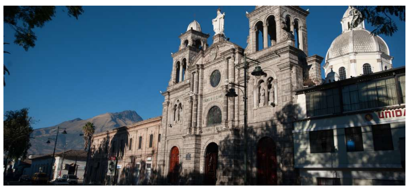
Ibarra, Imbabura.