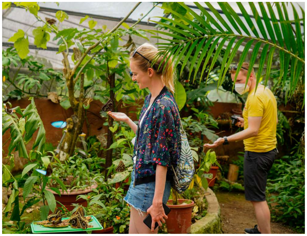
Mindo, Pichincha.