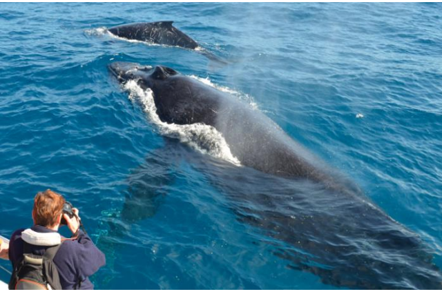
Intangible Cultural Heritage of Humanity by UNESCO – Paja Toquilla hat in 2012.