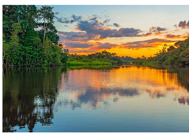
Intangible Cultural Heritage of Humanity- Zápara People (registered in 2008, countries of Ecuador and Peru).

Natural Heritage of Humanity- Sangay National Park in 1983.