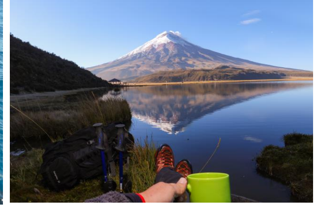
Cultural heritage of humanity by UNESCO (Quito in 1978, Cuenca 1999, Qhapaq Ñan (2014 together with Colombia, Peru, Chile, Bolivia and Argentina)).