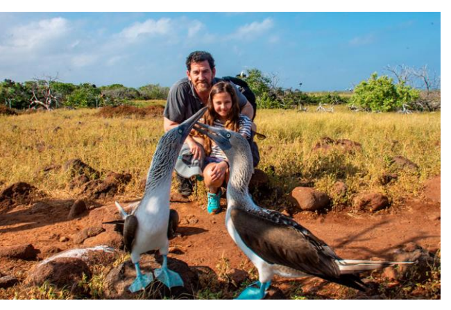
Natural Heritage of Humanity by UNESCO in 1976.